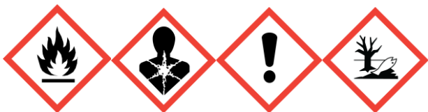
Flame Health Hazard Irritant Aquatic Hazard

Conforms to OSHA 29 CFR 1910.1200 and aligns to the United Nations Globally Harmonized System